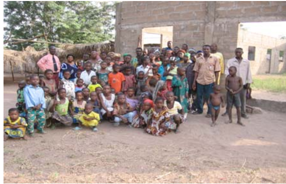
1987 : 4 pastors and nearly 100 church members.