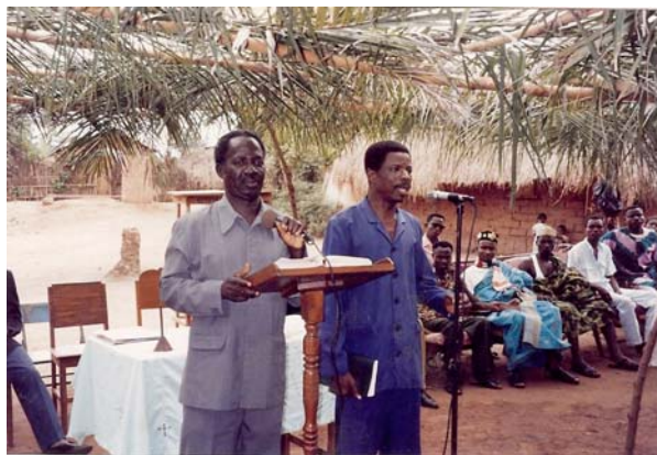
Bolougan, first planted church

September 7 to 13, 1998, The AELVNA team launched their first outreach in Bolougan on the seaside area of Togo. (21 adult souls not counting children)