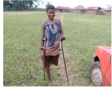
A young 11 year old sick girl