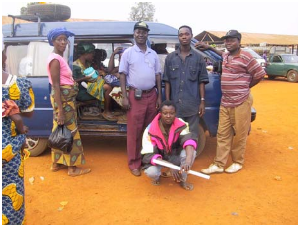
Leaving to the villages