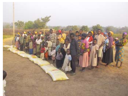
Food distribution to the orphans in Bolougan et Tchokpali