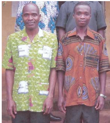
Two men trained in literacy teaching and Bible translation in Akebon language.

In 2001, AELVNA started an alphabetization or literacy programs for the local people, so they can get to read the Bible. After three months training, three women can now read the Scriptures in the Ewe language. AELVNA also trained two people in translation and literacy training for the AKEBOU local language. The translation is now being done, with the support of the WYCLIFFE and SIL (Société Internationale de Linguistique).