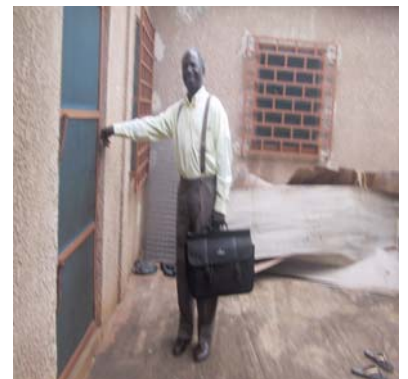
meeting times with God