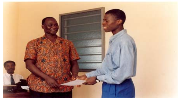
Seminar at Atakpame

The student workers receive a certificate at the end of the seminar