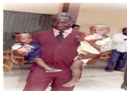
Children are coming to the Lord