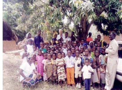
The joy of teaching children

September 7 to 13, 1998, The AELVNA team launched their first outreach in Bolougan on the seaside area of Togo. (21 adult souls not counting children)