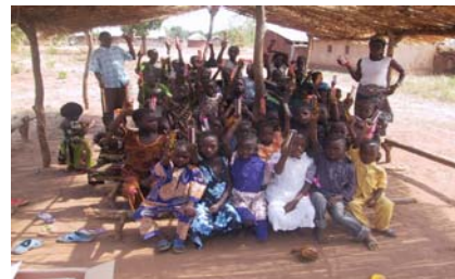
After the church meeting