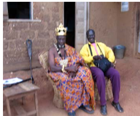
Negotiations with the village authorities

When the president of the association first goes to the village, his intention is to make first contacts with the local authorities, be friendly and encourage the people to establish a relationship so the Gospel can be preached later.