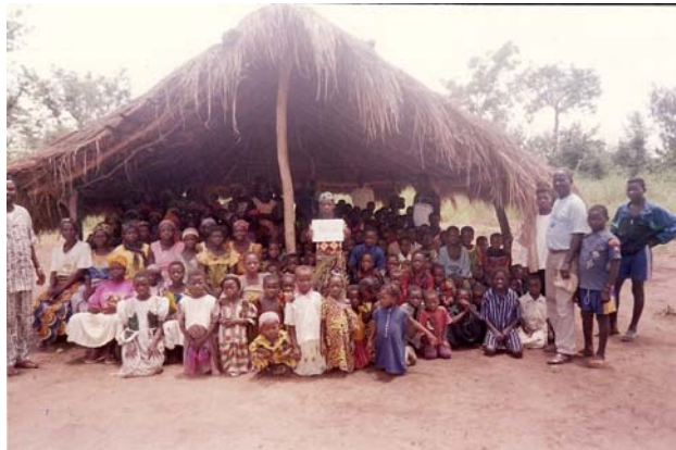
A worship place

3. Celebration of the first church meeting in a temporary place, in agreement with the village people, or building of a straw structure in agreement with the chief of the village.