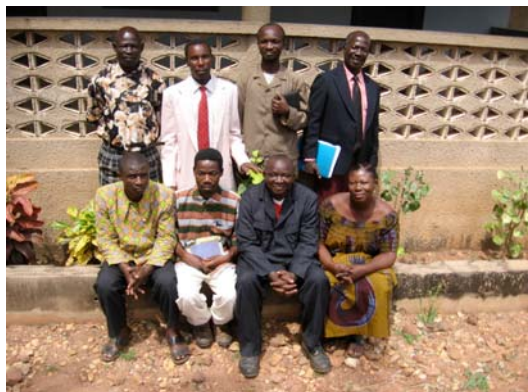
Representatives of AELVNA over 7 church districts in Togo (ASB). On January 3, 2008