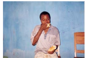
Two miracles in Azafi and Tchapkali Akebou

A baby girl who came back to life after 30 months of prayer Three years and 10 months in his mother's womb