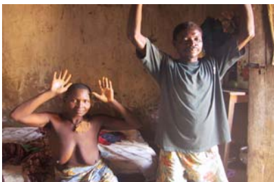
Souls coming to the Lord