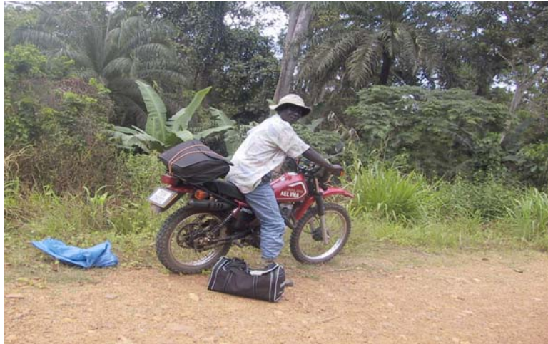
Akebou in the plateau region

Whom shall I send? And who will go for us? (Isaiah 6:8, Isaiah 42:6-7)