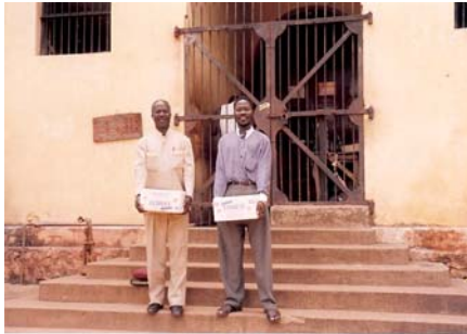
Presents to the prisoners