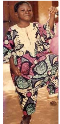
Hardship in ministry