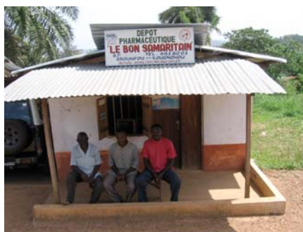
Our first pharmacy

Finding primary health care medicine at the right time is extremely difficult in villages. AELVNA shared this need while evangelizing and set up a small pharmacy in the village of Kougnohou, in the plateau area of the country. It provides for medicine to dozens of villages around. Before that people had to travel more than 80 km by bike or when possible by motorbike to get medicine from Atakpame (main town in the area) for urgent cases.