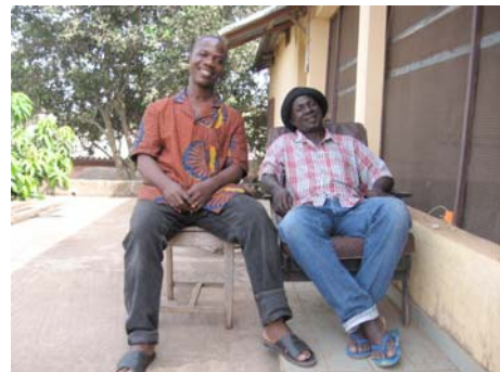
Some of the Timothys and Barnabases

The mission started well. We thought things were launched. But some bitter dissensions came up as in Acts 15:36-40 between Paul, Barnabas and John-Mark. Without being pessimistic, we must not let ourselves be taken by surprise.