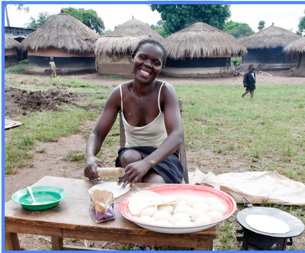
A Village in north Uganda, on the Sudan border, where we have planted a new church