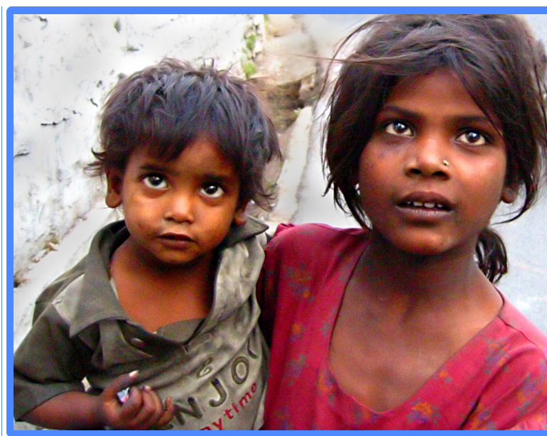
Beggar Children on the Street

During the alter call a girl was crying saying, "I never experienced Jesus like this before". In her testimony she said, "I didn't even fell like coming to the meeting, but an inner voice compelled me, and I am feeling so different." Her parents later told us she was going through a deep depression.