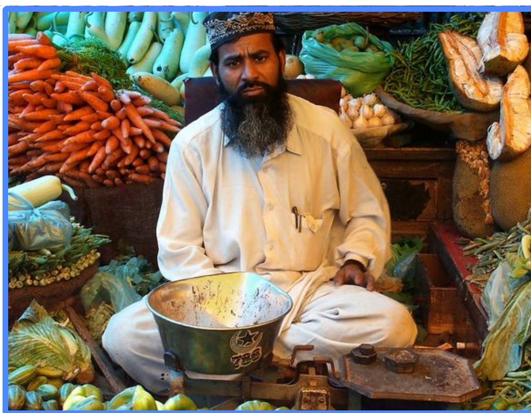
Vegetable Street Merchant