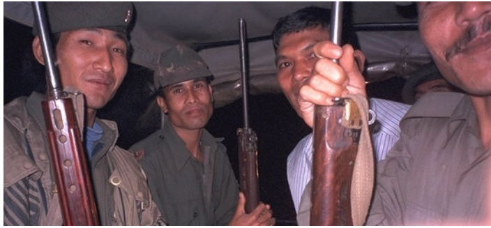
1999: Soldiers in Occupied Manipur