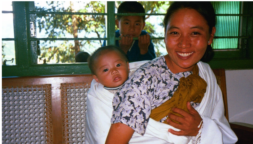
Mother and Child