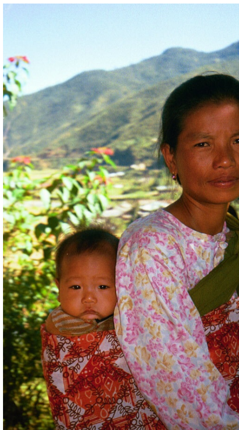
Mother and Child

So the church in the Himalaya Mountains of Manipur is thriving, though they are not without their problems. Life is hard, the churches are poor, and pastors minister with the great handicap of sparse resources.