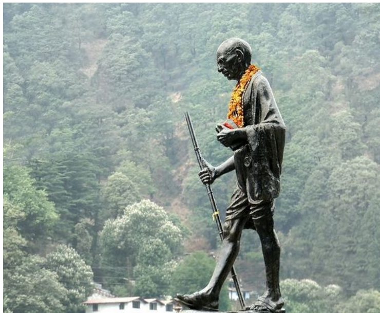
Statue of the Beloved Mahatma Gandhi

Considering this and giving this invitation more prayer, it became clear to me that I needed to accept their invitation.