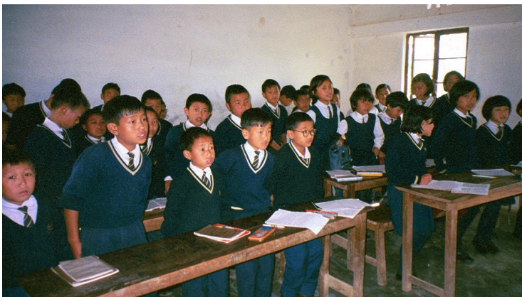
1999: School Children in the Village of Mao, Northern Manipur. The First Time These Children Had Seen White People!

In 1999 when Christians in northern Manipur learned that we were coming they called a special reconciliation service and invited other tribal groups to attend. They felt remorse for rejecting the gospel, and they were looking for a new blessing from God. Somehow they saw us as the catalyst for a new beginning.