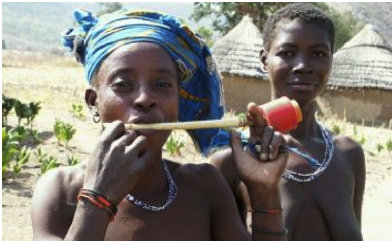
Demonstrating to Me A Homemade Musical Instrument

Essentially it is a matter of the heart. We let go of our cultural background and give our heart's allegiance to Christ.