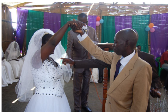
The Pastor and His Wife In the Preceding Photo