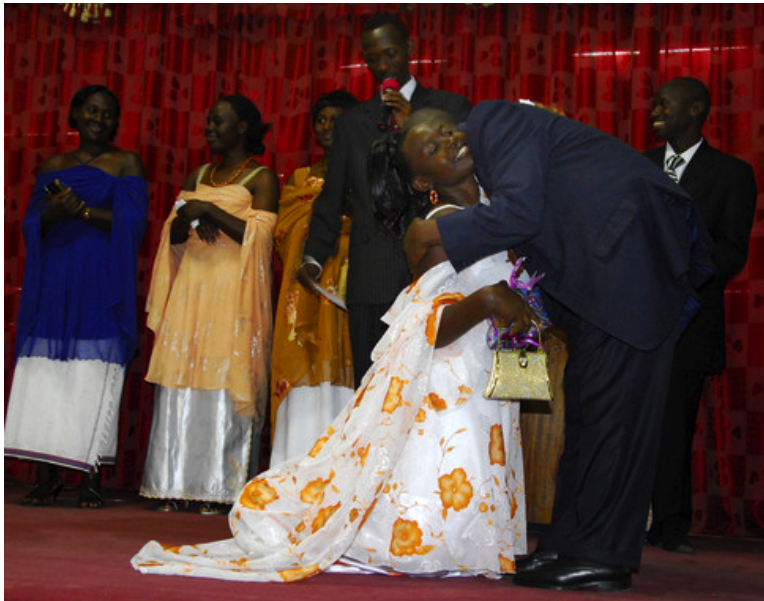
The Groom Received the Gifts and Accepted the Proposal

During the ceremony it is customary that the prospective bride will get on her knees before the potential groom and ask him if he will marry her. In part of the ceremony she is expected to give him gifts, as you can see in the photo. She also addresses him as “Master.”