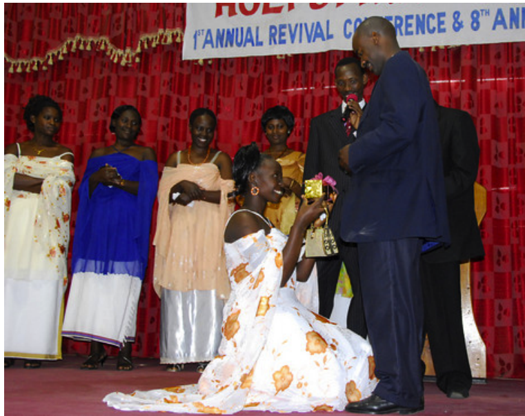
The Bride on Her Knees Before the Groom, Giving Him Gifts and Proposing

A rather large church in western Uganda asked me to preach on a Sunday morning. There was a special “engagement ceremony” during the service. Once again I was exposed to the tradition of a different culture.