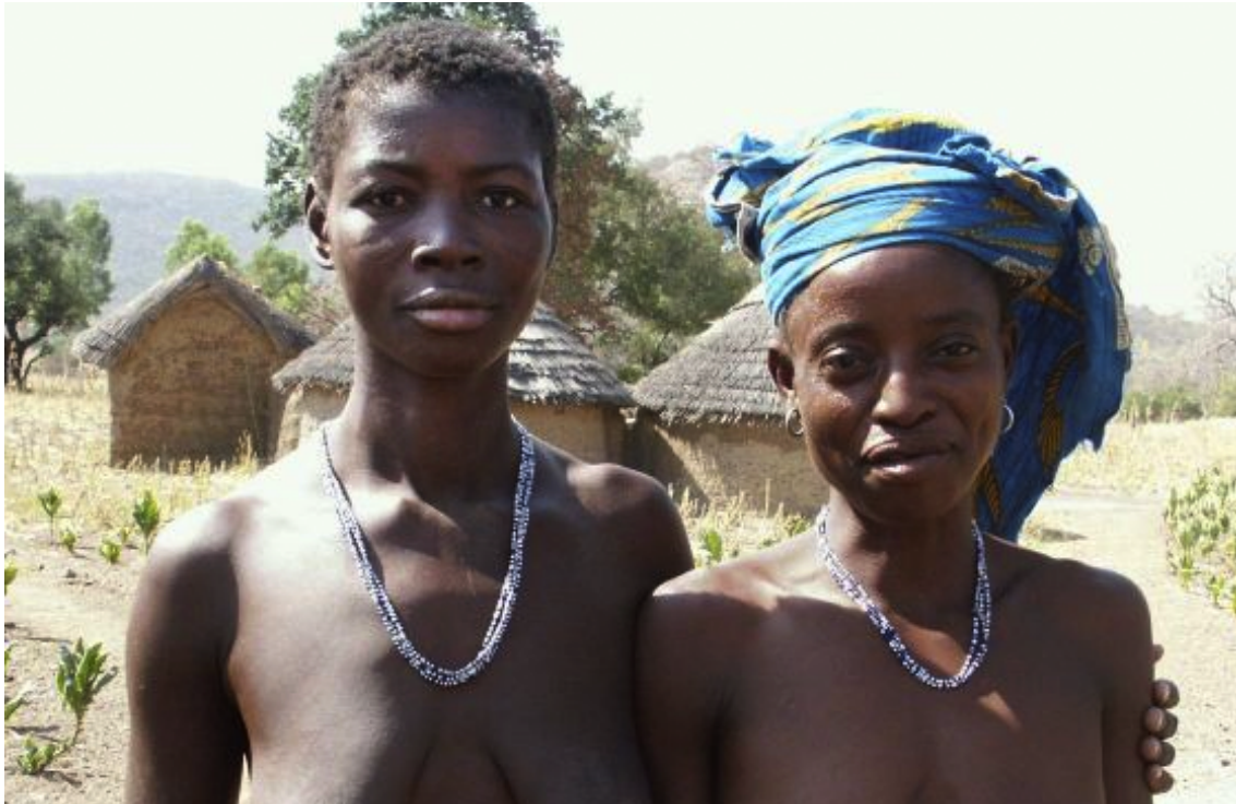
These Two Friendly Women Are Married to the Same Man