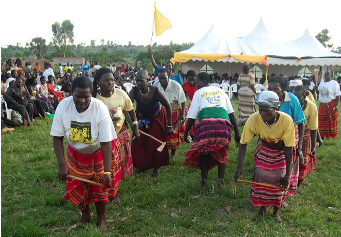
Traditional Dancing At the Wedding