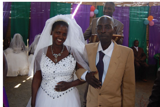
Here They Are Officially Married