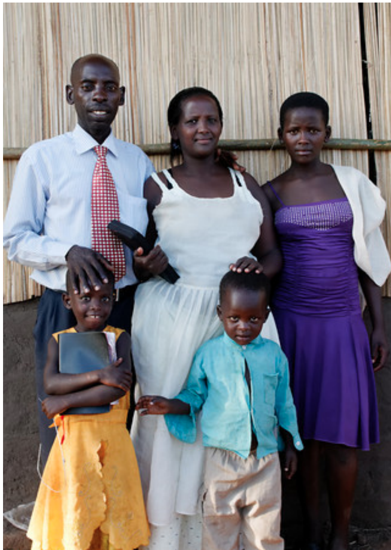
A Pastor and His Family of One of Our New Churches in Northern Uganda. This Pastor and His Wife Were Married In the Mass Wedding.

It was a very colourful occasion. In fact the whole of the town had come to witness the spectacular event. We had to remove the back side wall in order to allow people who had surrounded the church to witness.