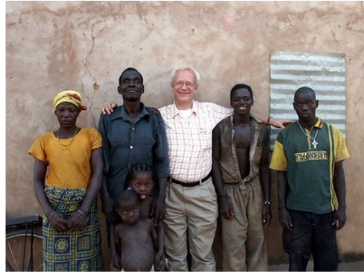
Here I am with the Chief and his Family

Over 70 people received Christ over the next two nights, including the tribal chief whom I met the afternoon of the last day. The chief's entire family surrendered their lives to Christ the last afternoon when we visited in their home. On the final night the chief gave a brief speech to his people about the need for his tribe to give allegiance to the Lordship of Jesus Christ.