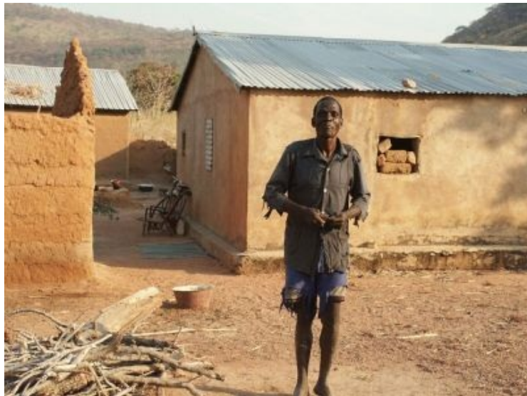
The Chief, Hurrying to Say Goodbye As I Was Leaving the Village

When I left the village of Nenebou the village chief came to me and thanked me for sharing the gospel. He and his family became new believers. As I was leaving he hugged me and kissed my neck. As I left along with our team we were elated to know the miracles that God performed in that village.