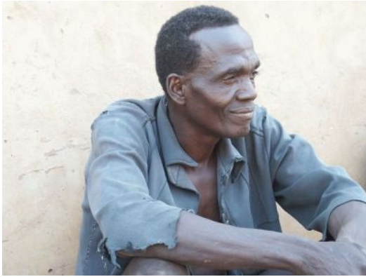
The Village Chief Of Nenebou