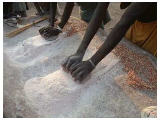
Grain Is Ground by Hand Into Flour