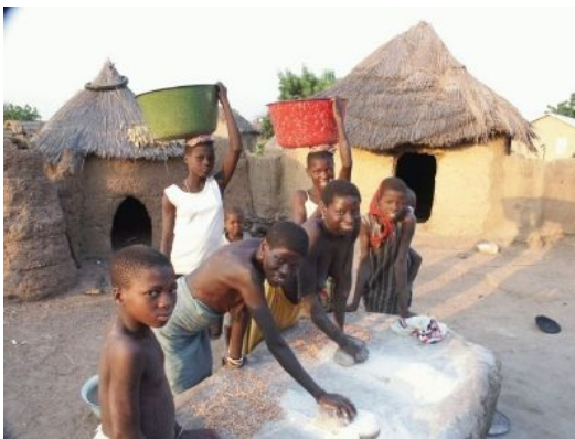
An Open "Kitchen"

For about 4 to 5 months out of the year the tribes face problems with starvation. During the good months they store food for the bad months but it doesn't always cover their needs. So frequently we have donated money to help feed them through the difficult weeks until they receive more crops.