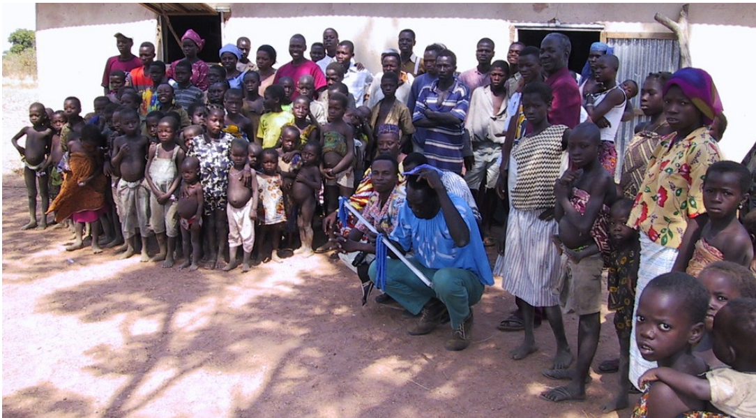
The congregation at the first Sunday morning worship service in Nenebou.

There are now two churches in two primitive tribes in north Benin. They both have pastors who speak the native language.