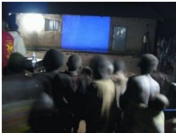
Using a Generator and a Projector We Were Able to Show Evangelistic Movies. These Villagers Had Never Seen People Moving On a Projected Screen Before!

The second small and primitive village was Nenebou whose people speak an obscure language called Waama. Fortunately a pastor from the nearby city of Tanguetta knew both English and Waama, so only one translation was necessary.