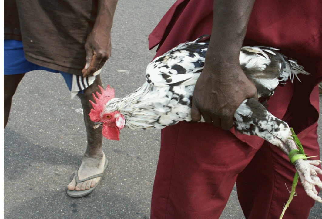
Nadjombe Holding His Payment

Frontier pastors such as Nadjombe are often supported in unique ways. Once I was with Nadjombe in a small village when a couple of dedicated church members wanted to bless him with a chicken. They handed over to him the live chicken. I heard the noise of that chicken for the next 100 miles as we returned to Nadjombe's home.