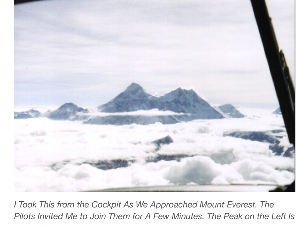
Mount Everest, The Highest Point on Earth.

ago today. The latest death toll is now 7,040 people and a total of 14,025 injured. It's believed that the death toll will exceed 10,000. In 1998 I visited the