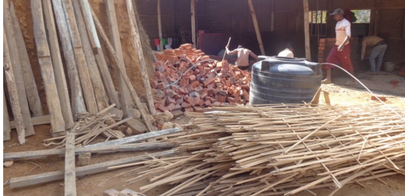
The temporary bamboo walls are being dismantled, the permanent concrete is being constructed