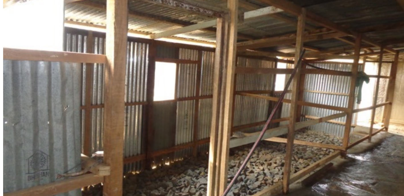
The verandah in the front side of the school on the point of completion.