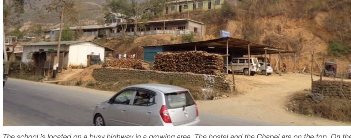
The school is located on a busy highway in a growing area. The hostel and the Chapel are on the top. On the middle and lower levels are classrooms.

Here are some recent photos they have sent me regarding the expansion of the school building: