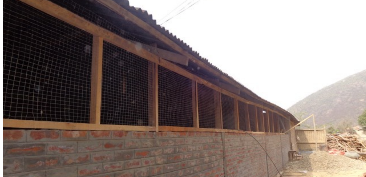
The rooms after being repaired (side view).

I might remind you of some points I made about the school in a previous newsletter: