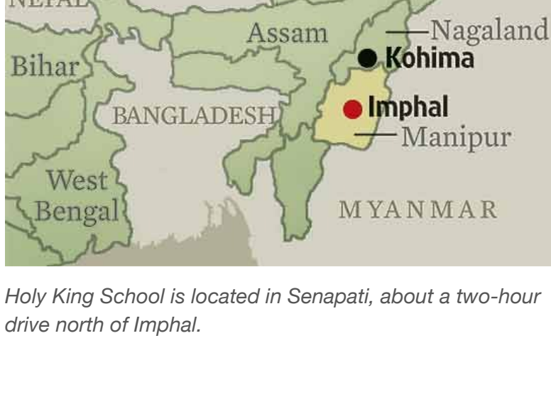
Holy King School is located in Senapati, about a two-hour drive north of Imphal.