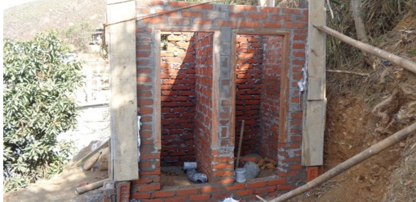
Two toilets are being built.