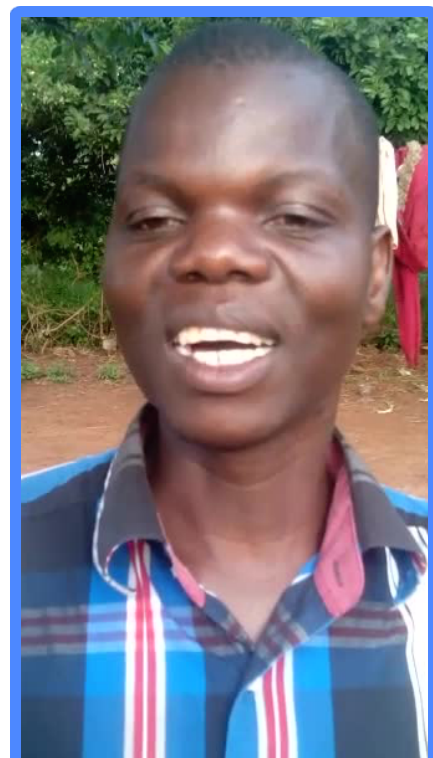
Speaking in English

CLICK on the Photos below For Video Responses of Gratitude.