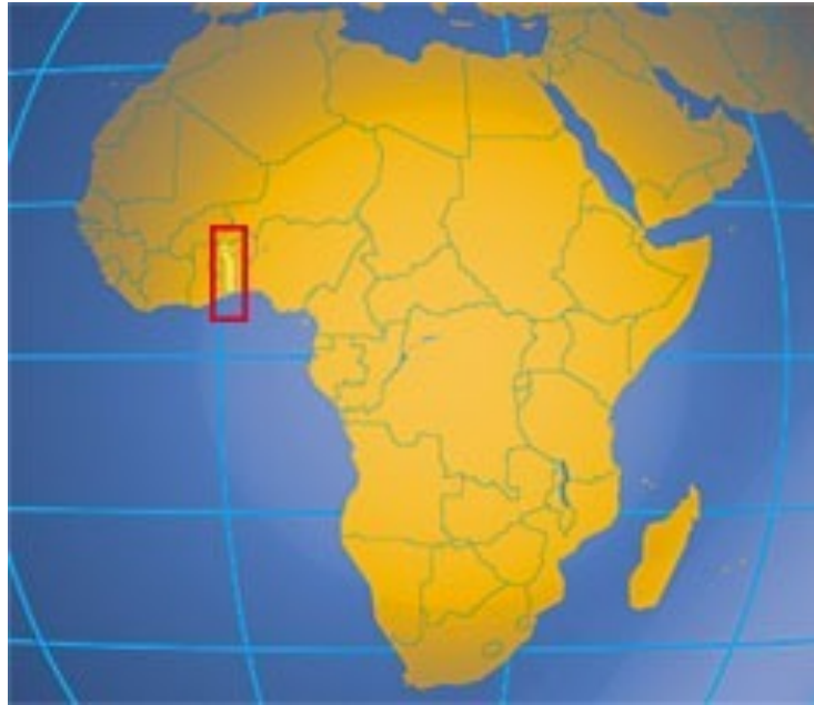
The Small Country of Togo In West Africa