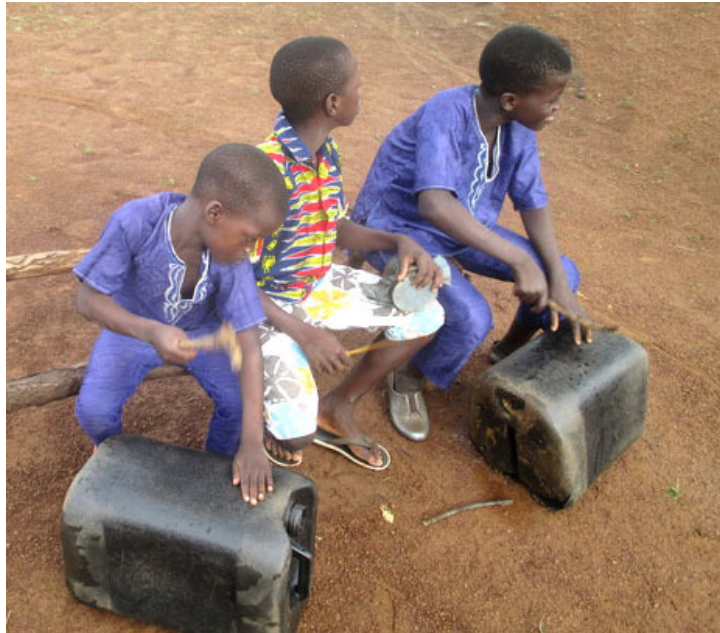
Improvising: Using Plastic Containers As Drums

We were able in this mission to visit five (5) regions in which my father has opened churches. And we found 21 churches in good shape.