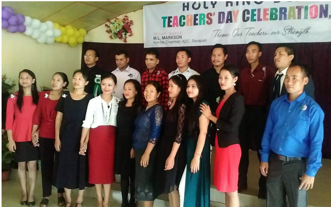
The Teaching Staff Of the Holy King School